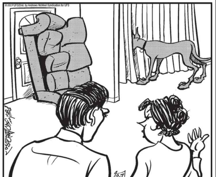
"He's been like that ever since he heard about the cat burglar."

Dated: January 24, 2019 Present holder of said mortgage