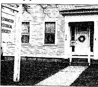
Westminster Historical Society

WESTMINSTER - A post-Christmas sale will be held at the Westminster Historical Society on Thursday, Dec. 26, from 9 a.m. to 1 p.m. at 110 Main St.