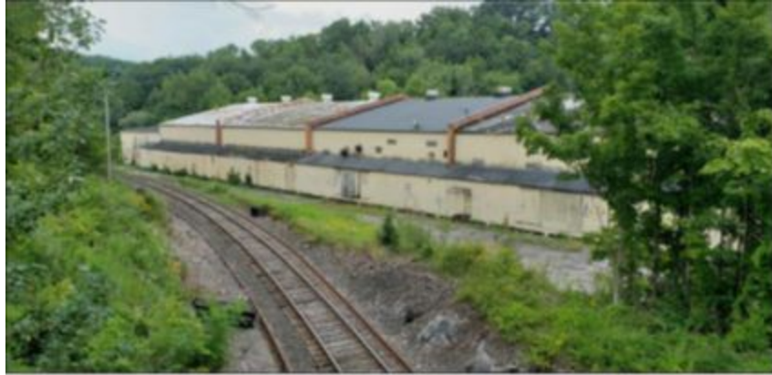
Schweitzer Mauduit Paper Mill - Lee, MA