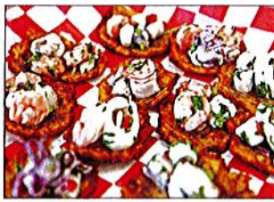
Ceviche at the newly opened Caney Los Panas at 26 Exchange St. in Bedford on Thursday.