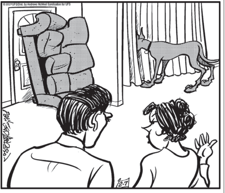
"He's been like that ever since he heard about the cat burglar."